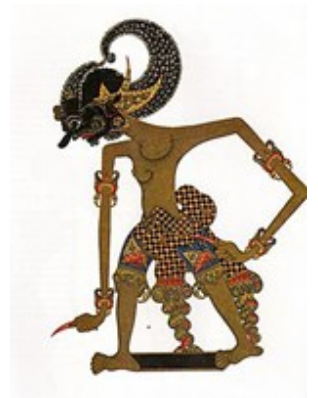
Wayang Kulit (shadow puppet)